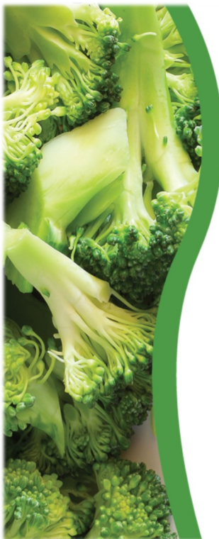
Plate It Up Kentucky Proud Recipe